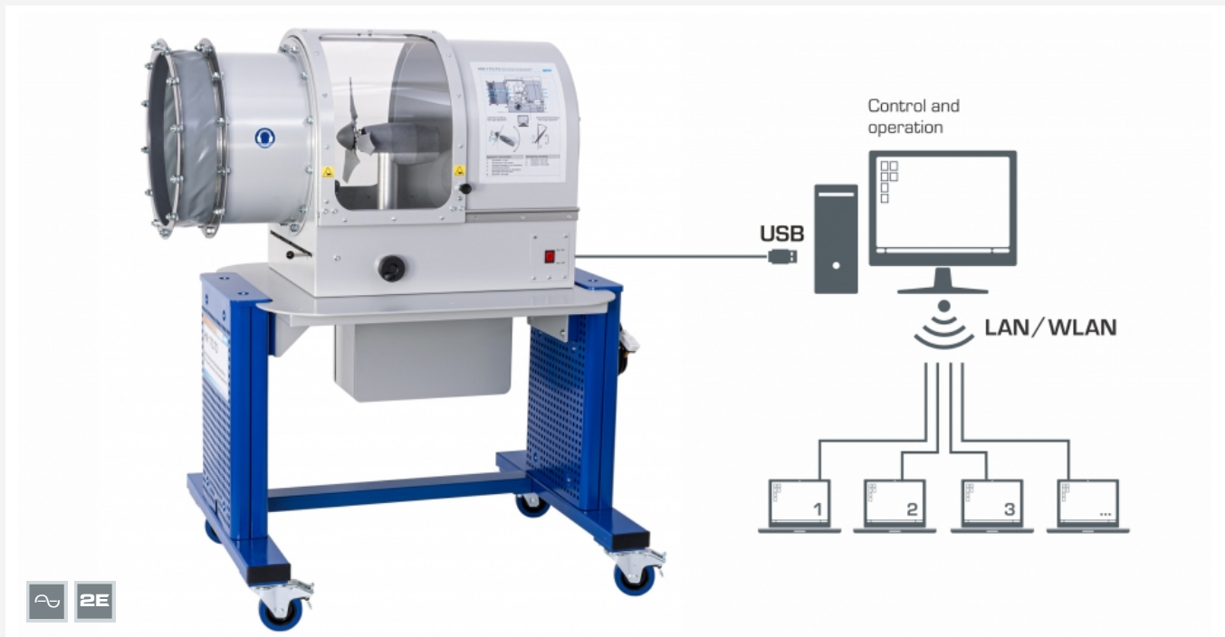
Network capable GUNT software: control and operation via 1 PC. Observation, acquisition, analysis of the experiments at any number of workstations via the customer's own LAN/WLAN network.