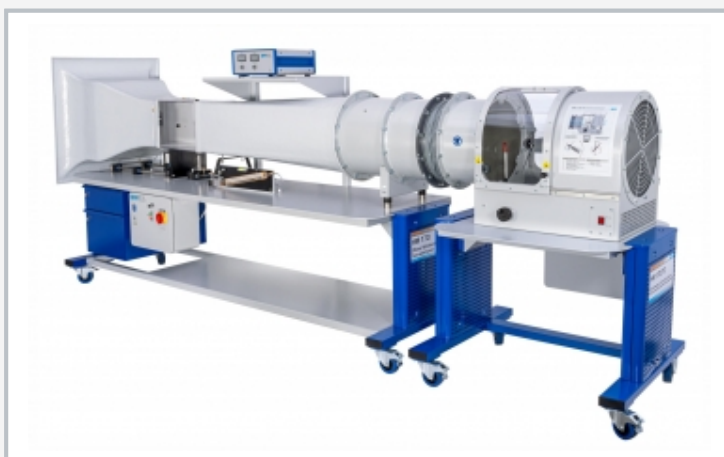
Open wind tunnel HM 170 together with HM 170.70