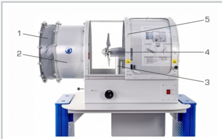
1 connection for HM 170 wind tunnel, 2 flow straightener, 3 tower, 4 wind turbine, 5 protective cover